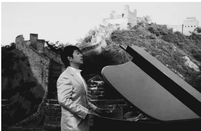
Figure 2. Lang Lang and his piano at the Great Wall (publicity photo).

In the program booklet of the Dragon Songs album, which will be discussed at greater length later, Lang reveals his nostalgia for his childhood in China. He compares the melodies of the works on the album to “fairytales,” and states