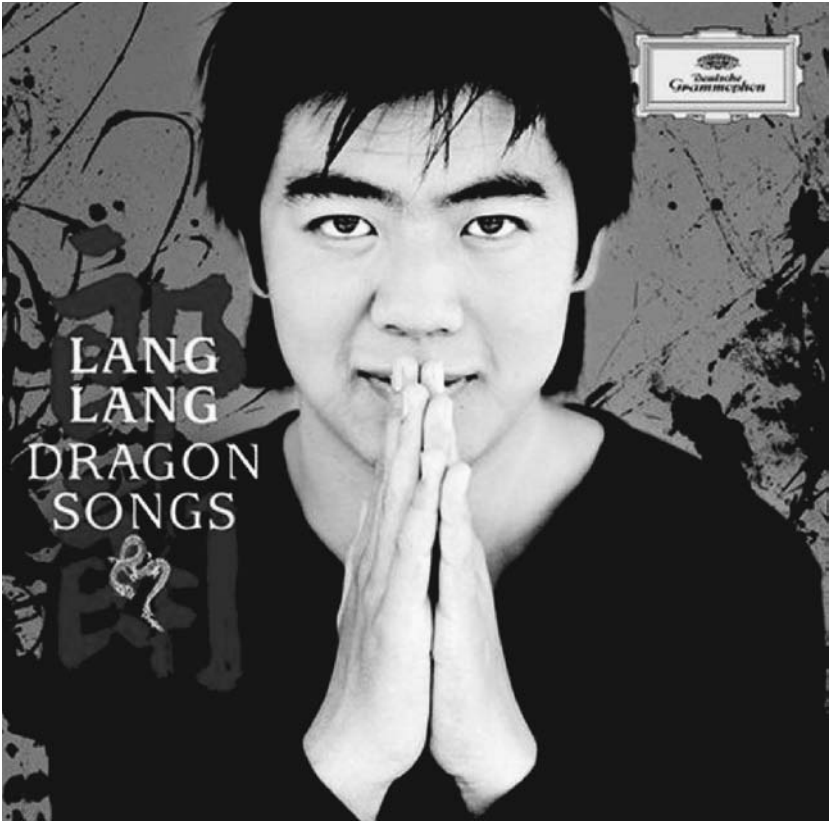
Figure 4. Cover photo of Dragon Songs .

In the end, Dragon Songs is only “a first try” by an idealistic 24-year old. I will keep my eyes open to see how this project proceeds from here.